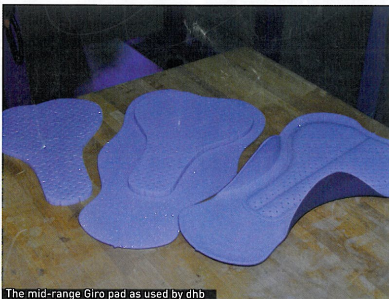
The mid-range Giro pad as used by dhb

MONTEBELLUNA is sports clothing manufacture. We passed Geox, The North Face, Northwave and Oxbow on our journey from the airport; Gaerne, Sidi and others are within spitting distance and the Converse All Stars R&D facility is next door. This plethora of technology and design expertise has major benefits. Finding the elastic, breathable foam required was only possible as it was manufactured originally for sports shoe soles — locally. In fact, every single constituent part of a Cytech pad is Italian; 90 per cent from the Veneto region. The furthest any component part travels to the factory is 200 kilometres. In this day of international business, it is refreshing to see a company support local businesses this way.