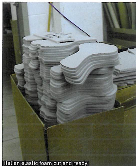
Italian elastic foam cut and ready

With Cytech's range consisting of 59 different designs — with models for road, mtb, tri and indoor cycling — and the custom pad business being considerable, one thing is certain: Cytech's pads may all be well made, but just because they share a logo, they are far from being equal.