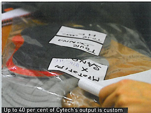
Up to 40 per cent of Cytech's output is custom

DURING our visit, the word 'performance' popped up continually. It is this obsession with continual improvement that has — no doubt — led to Cytech's success. Not only do many clothing manufacturers use its 'standard' pads (albeit often in a preferred colour), but the company also undertakes a huge amount of custom work. This can be a collaboration with Cytech's designers — taking various elements from existing designs and reworking into a new pad, or producing a product designed by the clothing company but using Cytech's huge knowledge and inventory of locally sourced foams, gels and fabrics. These custom pads (colour options are classed as standard product) make up 35-40 per cent of Cytech's business.