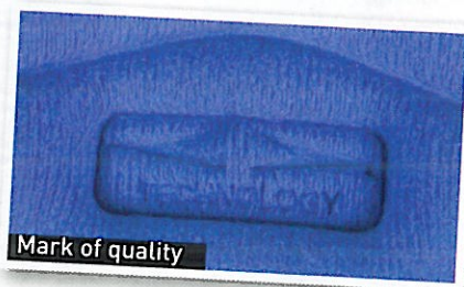
Mark of quality

DHB's pads may all share the Cytech logo but, even at a glance, it's easy to spot major differences. With the tights ranging from £38-£75, both the intended user and selling price are very different. The standard Pace tights use the Race chamois; an Elastic Interface Technology pad with anti-chafing fabrics that are far from the bottom of the Cytech pile. When you rise to the Pace Roubaix, Cytech's Giro chamois is included. Dual-density foam ranging from 60-80kg/m 3 and 3-10mm combines with three-dimensional construction to reduce bunching. In the bells-and-whistles Pace WP SuperRoubaix tights the Tour pad uses triple density foam from 60-120 kg/m 3 , ranging in thickness from 3-14mm.