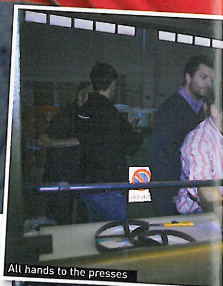
All hands to the presses

“They were disappointed with the lack of interest in improving this vital piece of equipment”